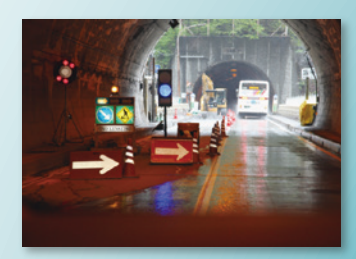
Service and utility tunnels, construction sites